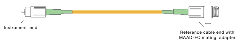
Figure 1: SAVER cable overview

The SAVER cables are designed to 'save' the instrument front panel from dirt, scratches and potentially expensive repairs and downtime. When the SAVER cable is used with the high quality mating adapter, MAAD-FC, your front panels will stay clean without adding loss. The SAVER cable can be repolished or replaced quickly and easily.