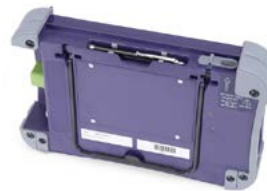
E6100 fiber module carrier