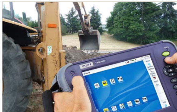
Portable and upgradeable platform with interchangeable test modules increases technician productivity

The flexibility of interchangeable module carriers and various plug-in modules let users create a platform that meets today's specific testing needs and yet it can evolve seamlessly to meet tomorrow's ever-changing network requirements.