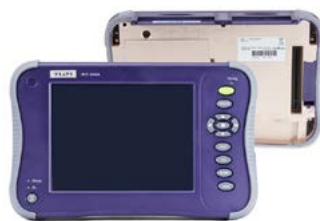
Back of the module carrier where other modules are attached

The multidimensional design of the T-BERD/MTS-6000A (V2) provides optimal configuration flexibility with extended battery life. The E6100 module carrier is best suited for fiber applications; whereas, the high-powered battery in the E6200 module carrier extends battery life when used with the carrier Ethernet (MSAM) or other intensive fiber applications.