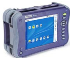
T-BERD/MTS-6000A Compact Network Test Platform

SmartAccessAnywhere offers technical support with remote access from anywhere.