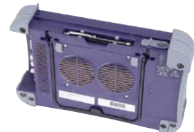
E6300 transport and fiber module carrier

T-BERD/MTS-6000A Compact Network Test Platform