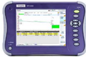
Compact multilayer platform for network installation and maintenance