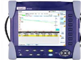
Scalable platform for multiple-layer and multiple-protocol testing