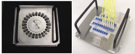
New MT 24-axis Holder

Description: Rubber & Glass Pads Available for various Hardness & Thickness (ask for details): 60, 65, 70, 75, 80, 85 & 90 durometer 4.8, 4.9, 5.0, & 5.05 mm thickness All for 5" diameter