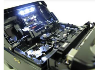
Illumination lamp: 3+1 LED