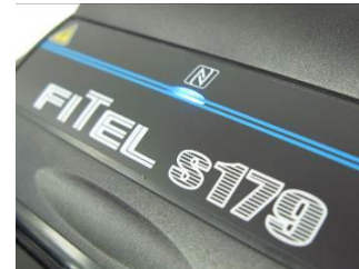
NFC: Lock and Unlock