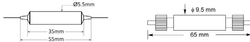
SM or PM isolator