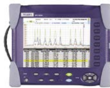
Scalable platform for multiple-layer and multiple-protocol testing