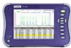
Modular platform for fiber and multiple-services testing