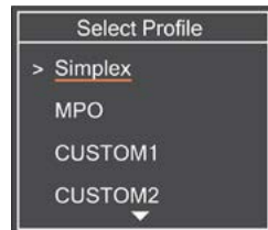
Figure 1a: Select Profile