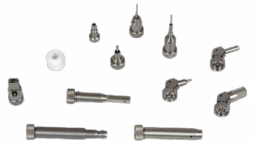
Figure 2: Examples of FCLT Series Cleaning Tips