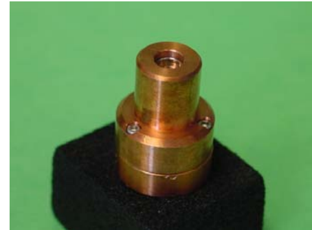
Figure 1: LuxxMaster® coaxial high powerpackage

This data sheet describes wavelength stabilized high power 785nm laser series in a coaxial package with collimated output. It is built utilizing PD-LD's patented Volume Bragg Grating® (VBG®) technology. This package includes a multiple transverse mode laser chip mounted and hermetically sealed inside a TO-9 or a TO-56 package. The laser TO can is then integrated into a copper heat sink for optimal optical & thermal performance. The laser output is collimated using an aspheric lens and optically stabilized using a VBG® element. This laser package includes optical isolation and a narrowband laser line filter for superior stability against back reflections and a high level of ASE suppression – features critical for Raman spectroscopy applications.