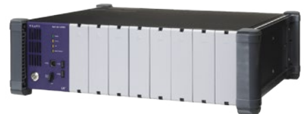
Figure 2b. Configuring the MAP-200KD next to the MAP-280 is optimal for applications where users require access to the device under test, the MAP-200 modules, and the GUI.