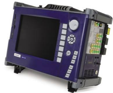
Figure 2a. Mounting the MAP-200KD on the MAP-230 is the optimal configuration for applications where users frequently require GUI access.

As Figure 2a shows, the MAP-230 mainframe can be used with the MAP-200KD module mounted on top of it. The pop-out feet on the mainframe let users position it in a front-facing manner for optimal viewing and interaction.