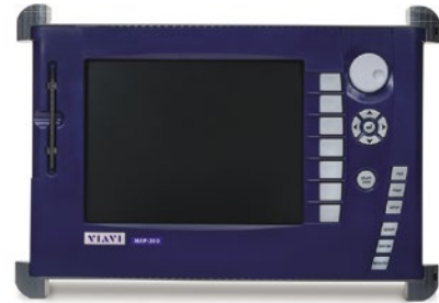
Figure 1. Keypad/display module

The graphical user interface (GUI) and local control of the MAP-200 mainframes work with standard universal serial bus (USB) keyboards, USB mice, and digital video interface (DVI) monitors. For added convenience and flexibility, Viavi offers an optional purpose-built keypad/display module (MAP-200KD) for local control capabilities, as shown in Figure 1. The MAP-200KD features a scroll wheel, seven soft keys, five navigation buttons, and seven pre-assigned buttons for use in navigating the GUI. Touch capability and user-friendly controls come standard for operation at the touch of a finger or with the supplied stylus. Located at the back of the MAP-200KD module is an industry-standard mounting port compatible with commercially available display mounts or the purpose-built MAP-200 keypad display 19-inch rack-mount kit (MAP-200A09). Alternatively, users can access the GUI using a PC via a virtual network connection (VNC) client.