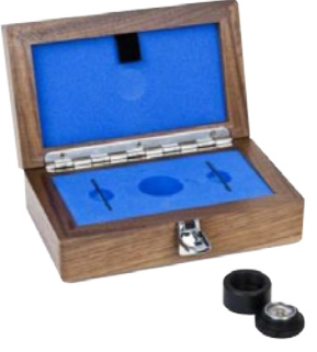
MPX Geometrical Calibration Artefact (Optional)