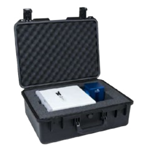
MPX-2 in Carrying Case (Optional)

info@lasercomponents.com www.lasercomponents.com