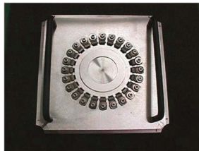
New MT 24-axis Holder

Description: Rubber & Glass Pads Available for various Hardness & Thickness (ask for details): 60, 65, 70, 75, 80, 85 & 90 durometer 4.8, 4.9, 5.0, & 5.05 mm thickness All for 5" diameter