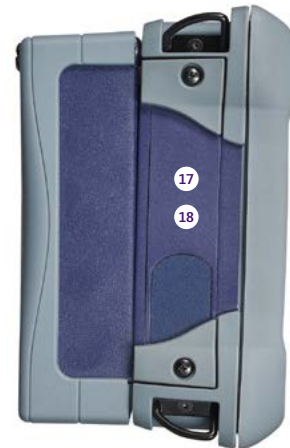
T-BERD/MTS-4000 Optical Test Platform