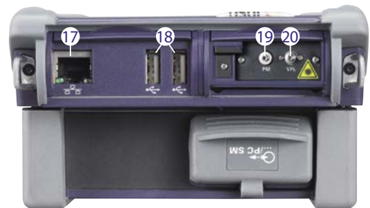
T-BERD®/MTS-2000 Handheld Modular Test Set