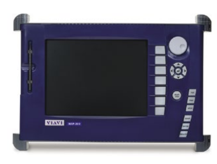
Figure 1. Keypad/display module

The graphical user interface (GUI) and local control of the MAP-200 mainframes work with standard universal serial bus (USB) keyboards, USB mice, and digital video interface (DVI) monitors. For added convenience and flexibility, Viavi offers an optional purpose-built keypad/display module (MAP-200KD) for local control capabilities, as shown in Figure 1. The MAP-200KD features a scroll wheel, seven soft keys, five navigation buttons, and seven pre-assigned buttons for use in navigating the GUI. Touch capability and user-friendly controls come standard for operation at the touch of a finger or with the supplied stylus. Located at the back of the MAP-200KD module is an industrystandard mounting port compatible with commercially available display mounts or the purpose-built MAP-200 keypad display 19-inch rackmount kit (MAP-200A09). Alternatively, users can access the GUI using a PC via a virtual network connection (VNC) client.