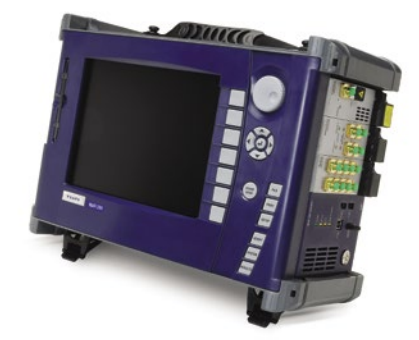
Figure 2a . Mounting the MAP-200KD on the MAP-230 is the optimal configuration for applications where users frequently require GUI access.

As Figure 2a shows, the MAP-230 mainframe can be used with the MAP-200KD module mounted on top of it. The pop-out feet on the mainframe let users position it in a front-facing manner for optimal viewing and interaction.