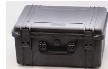
Hard Carrying Case