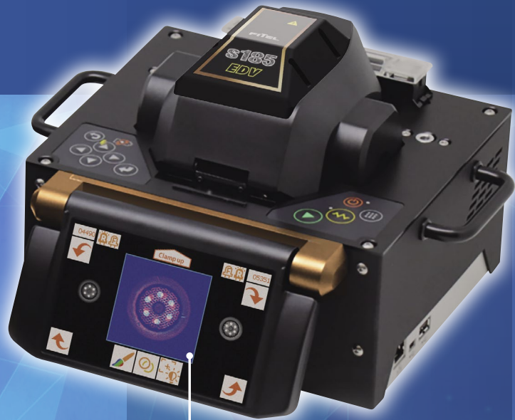
World's first Composite Image Technology - both fiber images overlapped for precise alignment