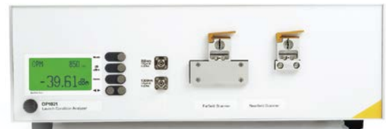
Figure 3: OP1021 Launch Condition Analyzer with far field and near field scanners

The OP1021 LCA is used to analyze how light is populated at the connector endface (near field), as well as measure how light is exiting the fiber endface (far field). With the proper overfilled source (included), the numerical aperture of the fiber can be measured. In addition, it can generate detailed reports on launch condition and compare to standard conditions for; Encircled Flux, 70/70, 80/80 or other specified launch conditions which can be calculated based on near field and far field scans. The OP1021 LCA is ideal for customers who need to test the launch condition of their production equipment or laboratory sources on a routine basis and is frequently used for military and aviation applications.