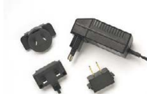
Worldwide compatible AC adapter/charger (SNT-121A)