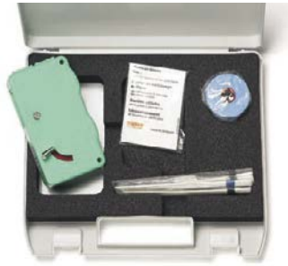
OCK-10 Optical Connector Cleaning Kit (accessory)