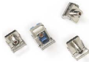
Optical adapters (BN 2150) for laser source output