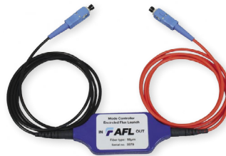
Encircled Flux (EF) Mode Controller

EF Compliant solutions available, see pages 3 - 4 for details