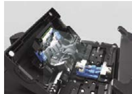
3 LED's provide a bright operation environment