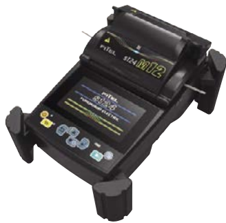
S124M12 Combining the functions of multiple machine's into one!