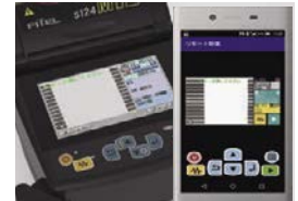
Touch panel and Wi-Fi network connectivity