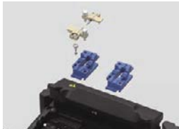
Easily exchangeable 200 and 250 μm fiber guide V-grooves