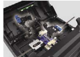
Detachable fiber clamp operation for easy fiber setting