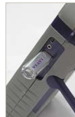
USB flash drive supports transferring test results