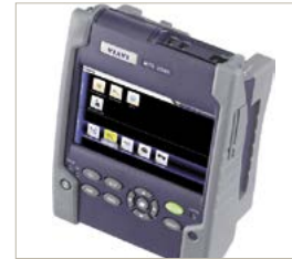
For more fiber testing and certification capabilities, combine the Certifier40G with one of the market-leading VIAVI fiber testers, such as the T-BERD/MTS-2000 and OLTS-85P