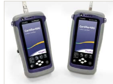
Two complete units minimize time initiating, naming, and saving results