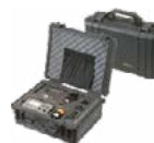
Pelican carrying case

This product cannot be used with DB15 extension cables