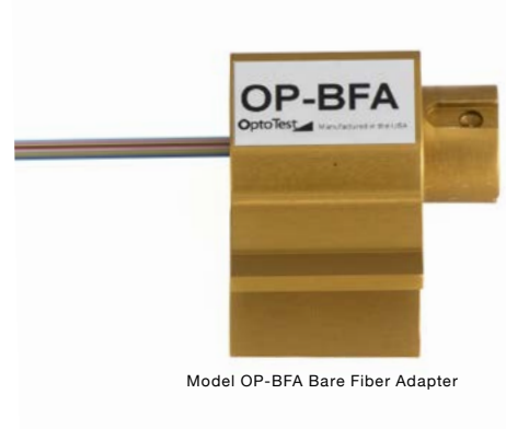
Model OP-BFA Bare Fiber Adapter