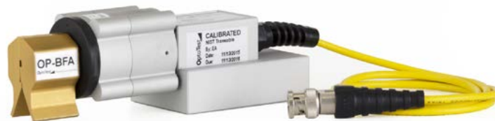
Model OP-BFA Bare Fiber Adapter connected to OP-SPHR Integrating Sphere and a Remote Head Detector.