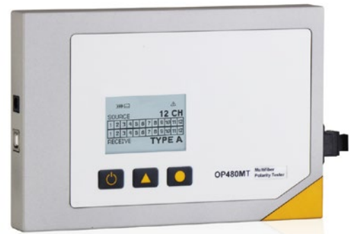
The OP480 provides a simple, handheld solution for testing polarity of multifiber connectors such as MTP/MPO, MXC, and PRIZM.