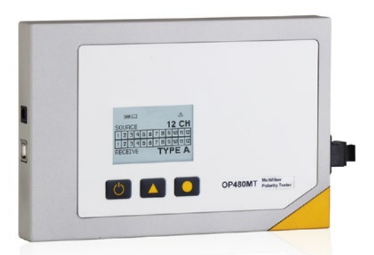
The OP480 provides a simple, handheld solution for testing polarity of multifiber connectors such as MTP/MPO, MXC, and PRIZM.