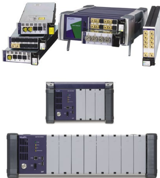
Figure 1. mSRC-C1 emitters deploy in all three MAP chassis formats. MAP-220C (2-slot), MAP-230B (3-slot), and MAP-280 (8-slot)

mSRC-C1 emitters have a simple, intuitive graphical user interface for use in simple R&D environments. For large remote test automation applications, all functions can be accessed through the remote interface over Ethernet or GPIB.