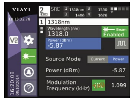
Figure 2. Windows displaying mSRC-C1 sources deployed in a MAP-220C