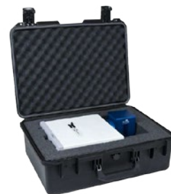
MPX-2 in Carrying Case (Optional)