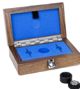
MPX Geometrical Calibration Artefact (Optional)