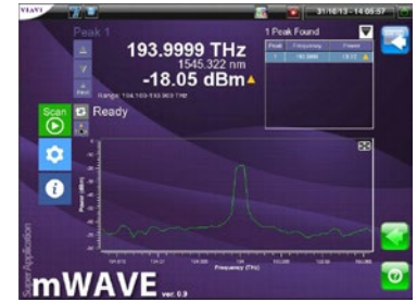
HROSA GUI with graphing capability and analysis tools