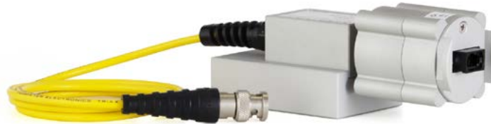
Figure 3: Model OP-SPHR attached to a remote head detector with a baseplate and an AD-SPHR-MTP adapter.