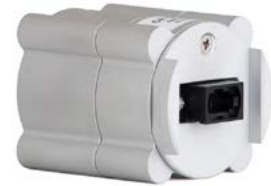
Figure 1: Model OP-SPHR Detector-Mounted Integrating Sphere.