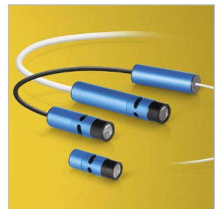
FLEXPOINT MVnano with flexible housing, focus, and optics options scanning at sub-millimeter line thickness

The scope of technological innovation has once again expanded to include the once unimaginable. The mission is simple: revolutionize our ability to see and know the undersea domain. As survey teams plan for next generation projects in asset inspection, exploration, and research, they are now resourced with the capability and capacity of their new underwater ally. The resultant force of underwater robots with SeaVision 3D imaging, MVnano line lasers and artificial intelligence propels the revolution in undersea vision and knowledge forward to new depths and illuminating frontiers.