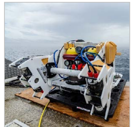
SeaVision™ mounted on unmanned underwater vehicle