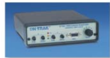
See OT-301 Position Sensing Amplifier for details.