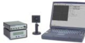
Complete On-Trak position sensing solution.

Complimentary BeamTrak software makes it easy to collect, display and ana-