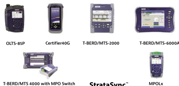
T-BERD/MTS 4000 with MPO Switch