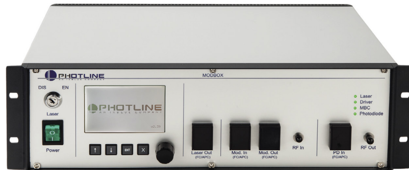
Analog ModBox with optional receiver - Front panel.

There are monitoring LEDs on the front panel upper right corner: Analog modulation drivers, MBC, Laser green LEDs monitor operation.