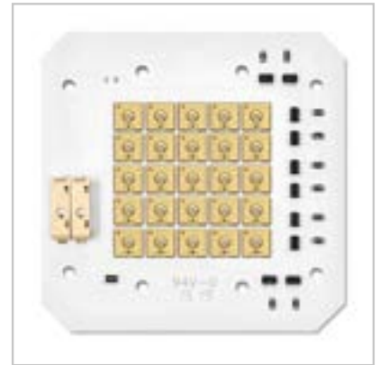
One 5x5 LED Array from Bolb provides powers up to 2.5W.

Please contact LASER COMPONENTS with any further questions.