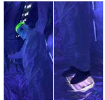
After 30 seconds, the protection suit is germ-free.