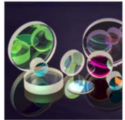
IR laser optics for lasers with infrared wavelengths.

Know-how is required to manufacture coatings in the mid-infrared wavelength range (i.e., the wavelength range that meets medical requirements). We have used ion beam sputtering (IBS) technology for this purpose with great success.