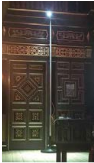
A streetlight demo with blue laser light transported by fiber to the phosphor element at top with optic.

Efficient transport of the blue laser light through a fiber optic enables designs where the white light source is almost purely optical in output and separable from the laser module and drive electronics. For example, streetlights and stadium lights are an application area where this configuration offers a benefit, reducing service needs at the light head at the top of the pole. The phosphor-converting element could be permanently sealed in a lighter, smaller optical structure less subject to wind and costly service visits on a mobile lift. The laser module and electronic assemblies are positioned in the pole, base or underground.